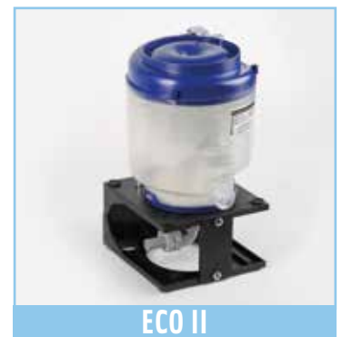
Order no International: 01050004 Order no Germany: 01050005