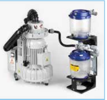
EXCOM hybrid A2