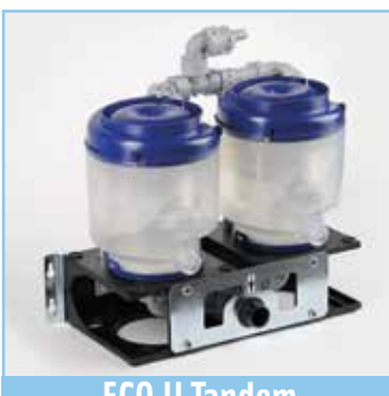
• Order no International: 01050007