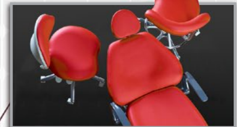
ERGONOMIC BASE PLATE