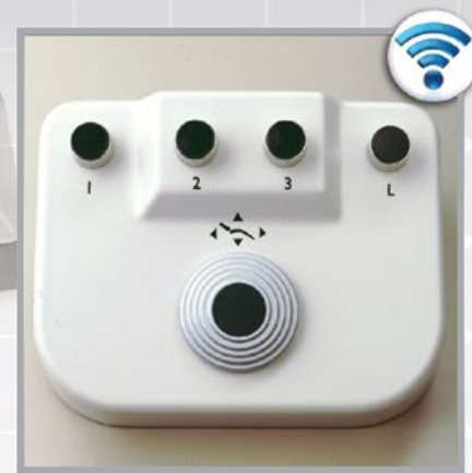
WIRELESS FOOT CONTROLS