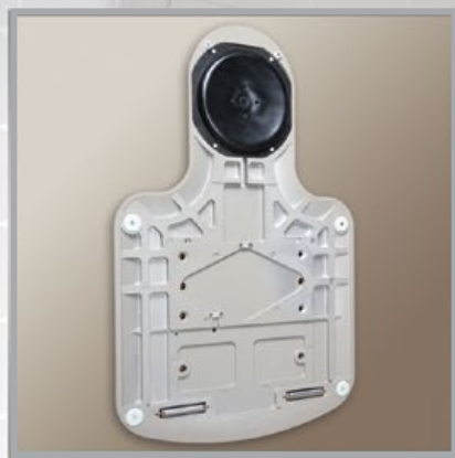
EXCLUSIVE AIR GLIDE