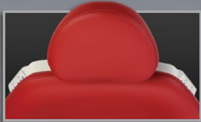
DUAL LOCATION TOUCH PADS WITH DOUBLE ARTICULATING HEADREST