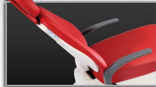
ULTRA THIN BACK