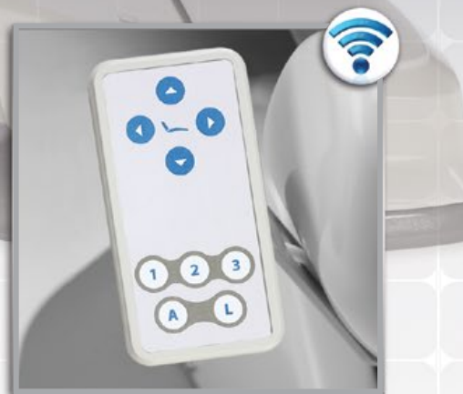
REMOTE MOUNTED TOUCH PAD