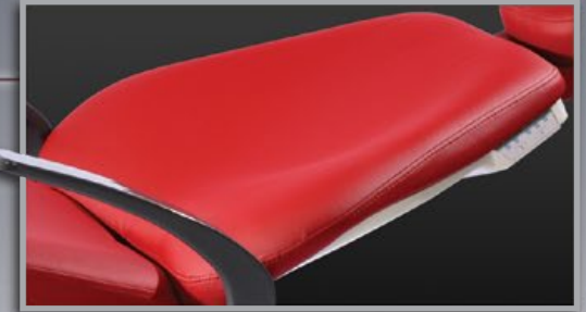
TAPERED NARROW CHAIR DESIGN