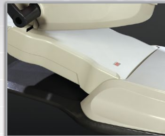
ILLUMINATED "ON" INDICATOR ON WIDER CANTILEVER ALSO DISPLAYS ERROR CODES