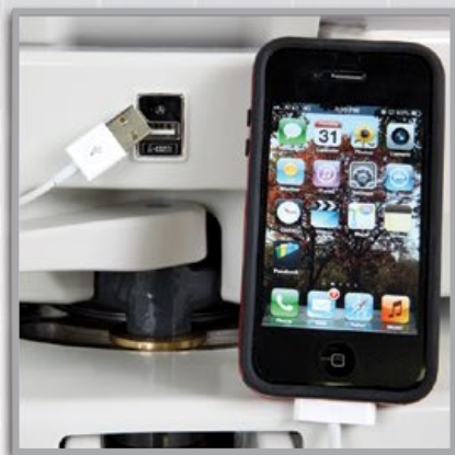
OPTIONAL USB POWER SUPPLY