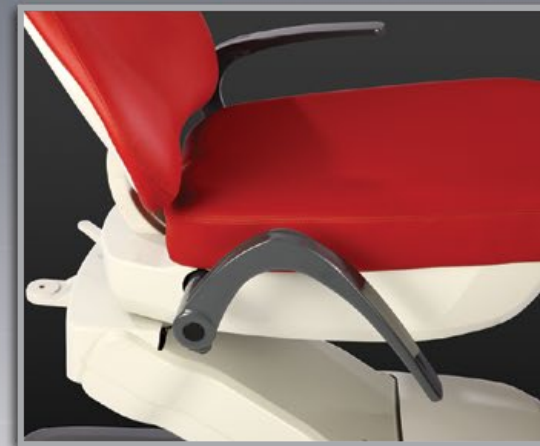
DROP DOWN ARMRESTS