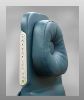
Dual membrane controls on the J-Chair help the dental team position the patient quickly and easily.