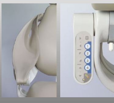
J/V-Generation Touch Pad Controls