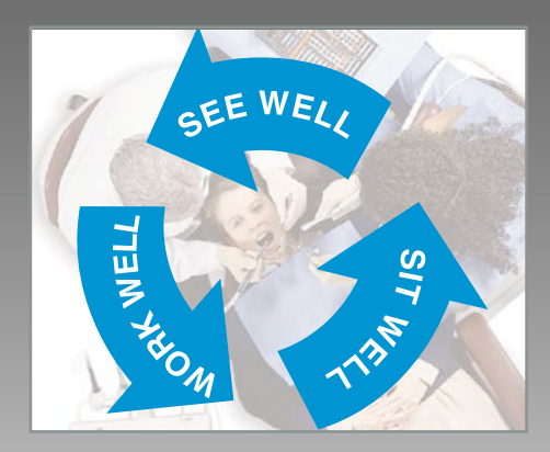
The DentalEZ* patient chairs deliver outstanding ergonomic benefits.

The revolutionary J-Chair and J/V-Generation Chair provide an ergonomically sound working environment for dental professionals who must spend long hours in the operatory.