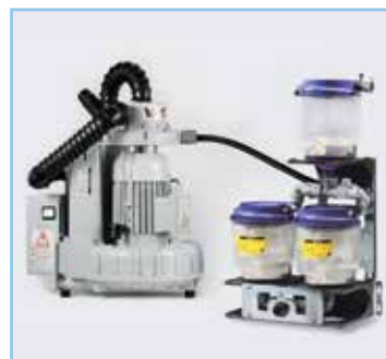
EXCOM hybrid A5