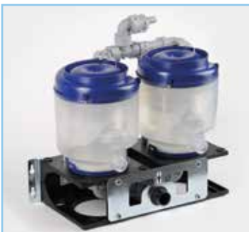
ECO II Tandem