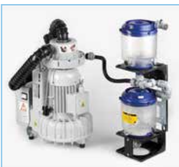
EXCOM hybrid A2