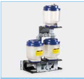
ECO II Tandem D