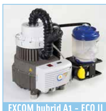
EXCOM hybrid A1 - ECO II

• EXCOM hybrid A1 - ECO II, Order no: 02010251