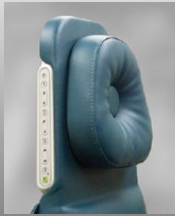
Dual membrane controls on the J-Chair help the dental team position the patient quickly and easily.