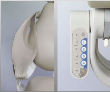
J/V-Generation Touch Pad Controls