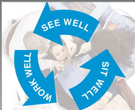
The DentalEZ® patient chairs deliver outstanding ergonomic benefits.

The revolutionary J-Chair and J/V-Generation Chair provide an ergonomically sound working environment for dental professionals who must spend long hours in the operatory.